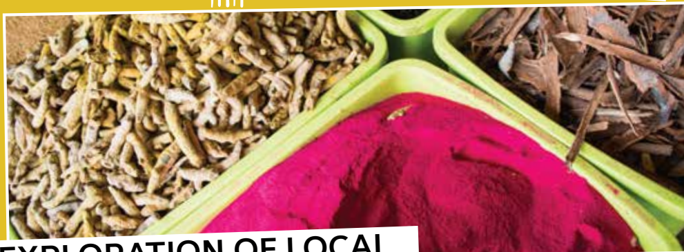
EXPLORATION OF LOCAL NATURAL RESOURCES