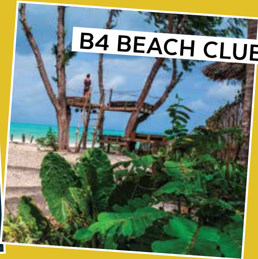
B4 BEACH CLUB