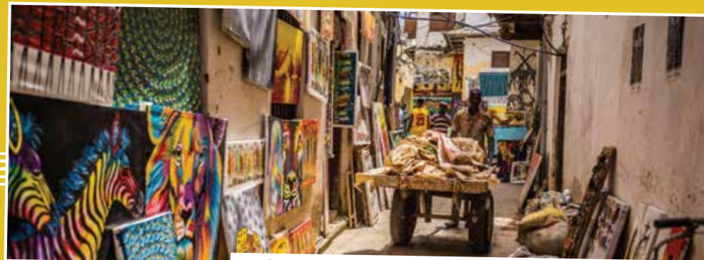
LOCAL CULINARY, ARTS AND LOCAL MUSICAL EXPERIENCE